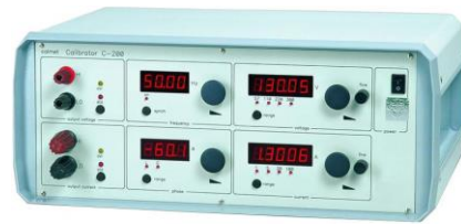
C200 single phase source up to 20A C200B single phase source up to 100A

Series C200 Calibrators has been built in standard 19" aluminium case. The C233 Calibrator is constructed in three cases and consists of one calibrator basic configuration (phase L1) and two calibrators in special configuration (phase L2 and phase L3).