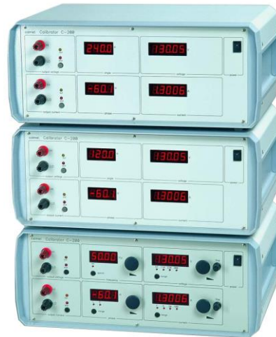
C233 three phase symmetrical source up to 20A C233B three phase symmetrical source up to 100A