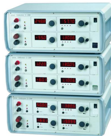
C233C three phase asymmetrical source up to 20A C233BC three phase asymmetrical source up to 100A