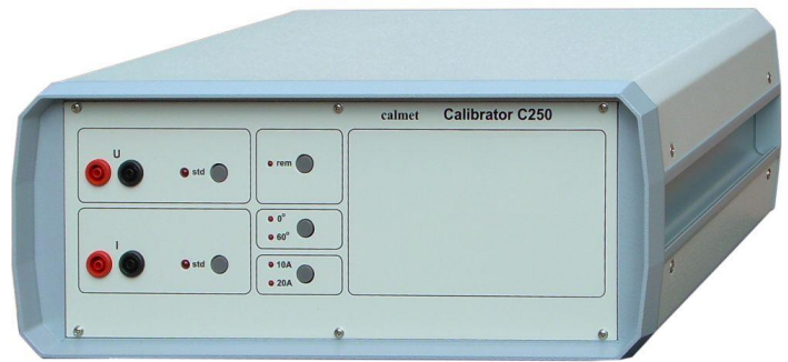
C250 single phase source up to 20A and 240V

Series C250 Calibrators has been built in small size and light weight aluminium case.