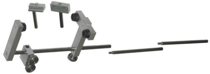
Photo head's holder UCF100 is designed for alternative mechanical mount of CF100 photo head, which with Calport100, Caltest10 and Caltest300 testers or C300 power calibrator are used for testing electronic and inductive energy meters. The UCF100 holder allows to mount a photo head to energy meters when it is difficult to mount heads to the meter by the head's sucker, e.g. minus temperature or when there is no place near meter.