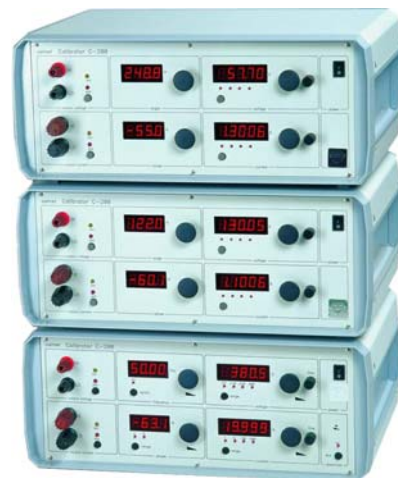
C233C three phase asymmetrical source up to 20A C233BC three phase asymmetrical source up to 100A