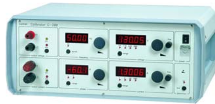
C200 single phase source up to 20A C200B single phase source up to 100A

The C200 Series Power Calibrators are used for adjusting, checking and verification of measuring instruments used in power engineering: active and reactive power meters, phase meters, frequency meters, ammeters, voltmeters, transducers of these quantities, monitoring systems and frequency, voltage and current relays in single and three phase symmetrical and asymmetrical configurations for symmetrical and asymmetrical loads.