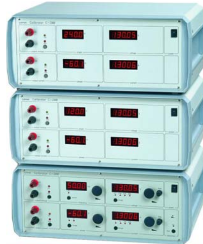
C233 three phase symmetrical source up to 20A C233B three phase symmetrical source up to 100A

Series C200 Calibrators has been built in standard 19" aluminium case. The C233 Calibrator is constructed in three cases and consists of one calibrator basic configuration (phase L1) and two calibrators in special configuration (phase L2 and phase L3).