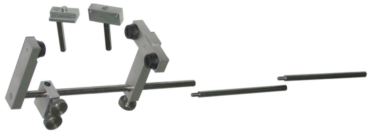
Photo head's holder UCF100 is designed for alternative mechanical mount of CF100 and CF101 photo heads, which with Calport100, Caltest10 and Caltest300 testers or C300 power calibrator are used for testing electronic and inductive energy meters. The UCF100 holder allows to mount a photo head to energy meters when it is difficult to mount heads to the meter by the head's sucker, e.g. minus temperature or when there is no place near meter.