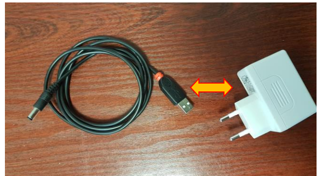
Disconnect the USB connector from the power