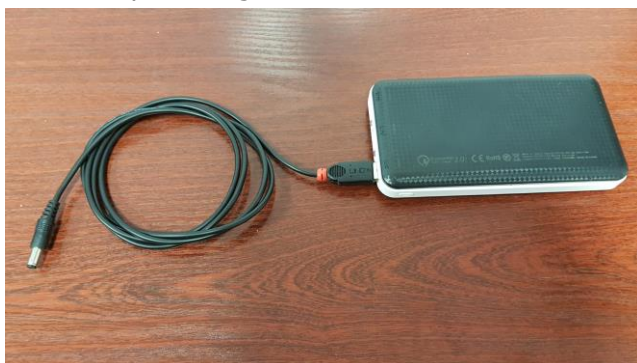
Connect the USB cable to the Power Bank output