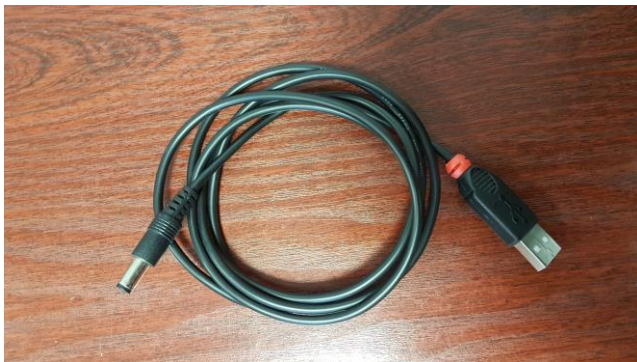
Cable for powering TE30Lite via Power Bank