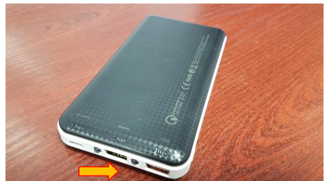
Power Bank with USB power outputs